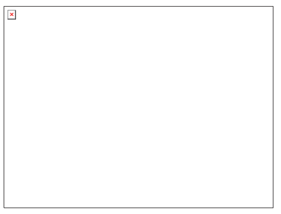
Figure 2-2: External view of Alice .