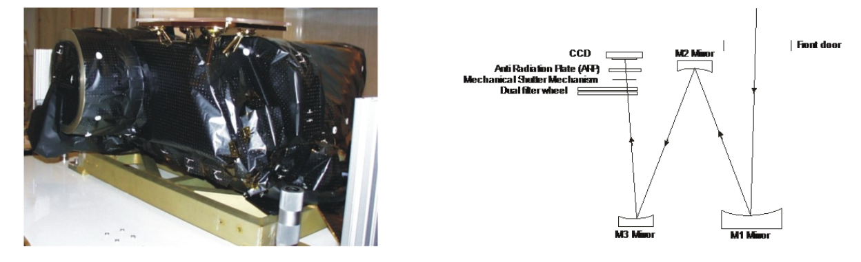
Figure 1: (left) The OSIRIS NAC flight unit in the lab. (right) The NAC Optical path

The NAC (Figure 1) uses an off axis three mirror optical design. The off axis design was selected in order to minimize the straylight reaching the CCD (the NAC has a proven stray light attenuation of better than 10<sup>-9</sup>). The optical beam is reflected by the three mirrors (M1, M2 and M3) before passing through a double filter wheel, a mechanical shutter mechanism and an anti-radiation plate (ARP) before reaching the CCD.