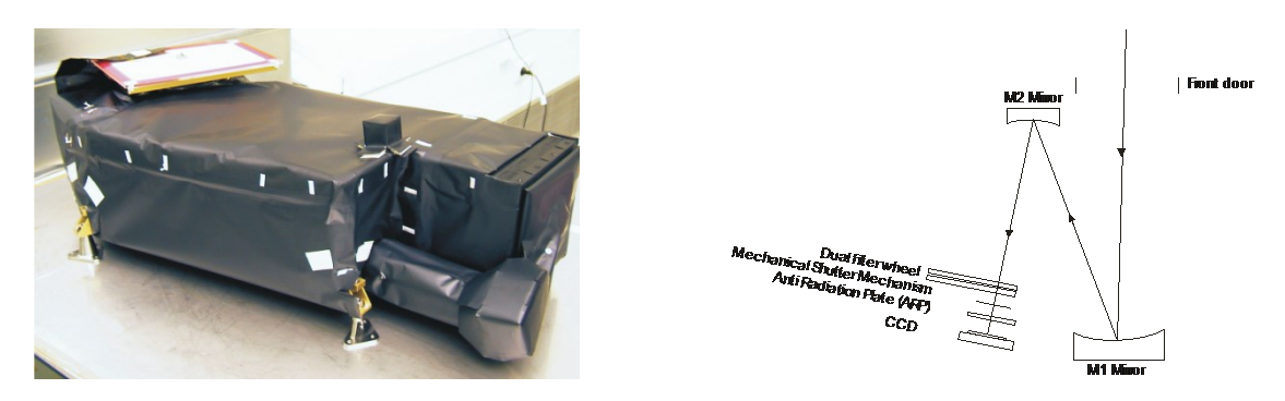
Figure 2: (left) The OSIRIS WAC flight unit in the lab. (right) The WAC Optical path

The optical beam is reflected by the two mirrors (M1 & M2) before passing through a double filter wheel, a mechanical shutter mechanism, and an anti-radiation plate (ARP) before reaching the CCD.