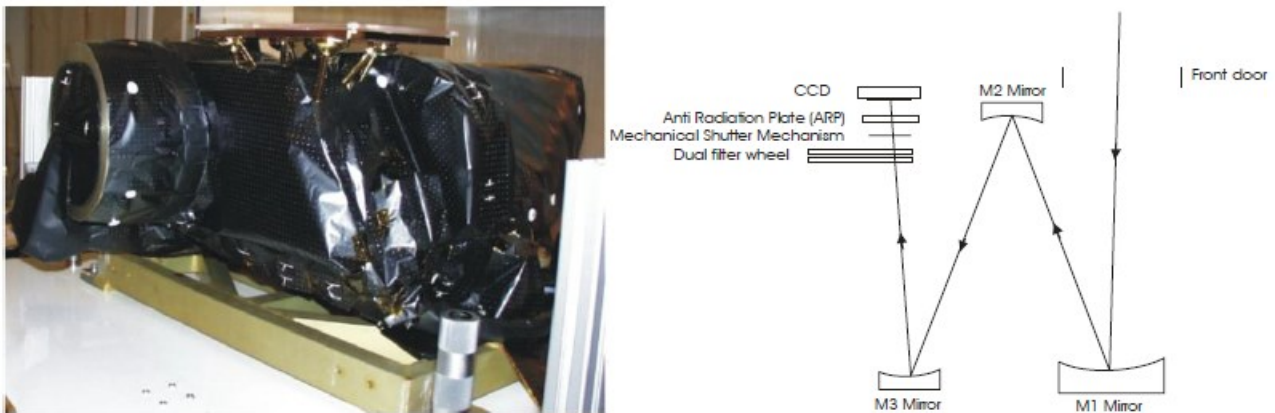
Figure 2 OSIRIS NAC flight unit (left) and optical path (right)

The NAC has a field of view of 2.20 \times 2.22 deg and a resolution on ground from 100 Km of 1.86 m/pixel. It operates in the 250-1000 nm wavelength range. For further technical specifications see the table below.